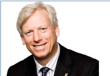
David Miller, former Toronto mayor

On October 26, 2011, join us for our annual Lowes Fund Breakfast Seminar at the National Club, in Toronto. This year's featured speaker will be David Miller, former Toronto mayor, who is currently serving as counsel for International Business and Sustainability with Aird & Berlis, LLP. He will be speaking on fighting climate change and creating a prosperous society. The breakfast is sponsored by Swiss Reinsurance Company Ltd.