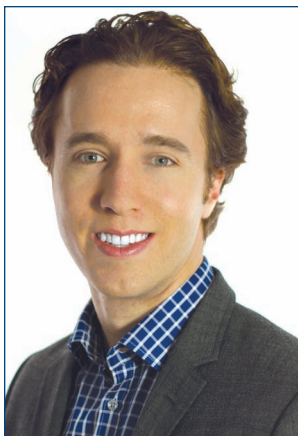
Craig Kielburger, Founder, Free the Children

Our annual GTA convocation and awards night will take place on January 26, 2012, at the Metro Toronto Convention Centre. Come connect with other industry professionals and join us in celebrating the achievements and hard work of our members and graduates.